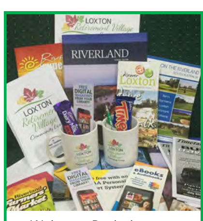
Welcome Pack that new residents have been receiving when they move into the Village